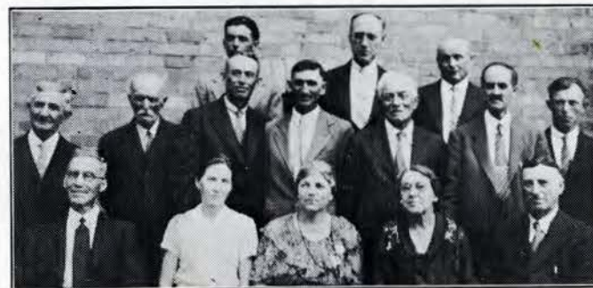
THE OFFICIAL BOARD