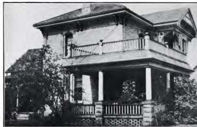
SHEDDEN UNITED CHURCH PARSONAGE

In the thirty-three years of work the ladies have raised approximately $6,000.00.