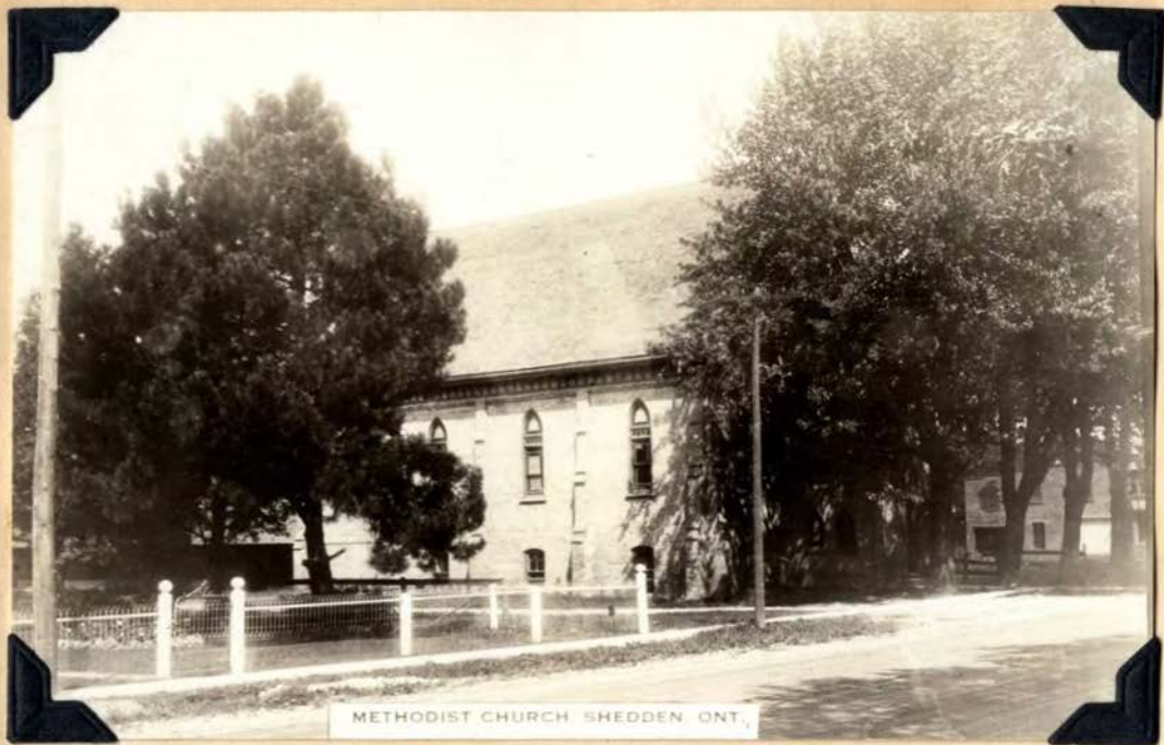
METHODIST CHURCH SHEDDEN, ONT.